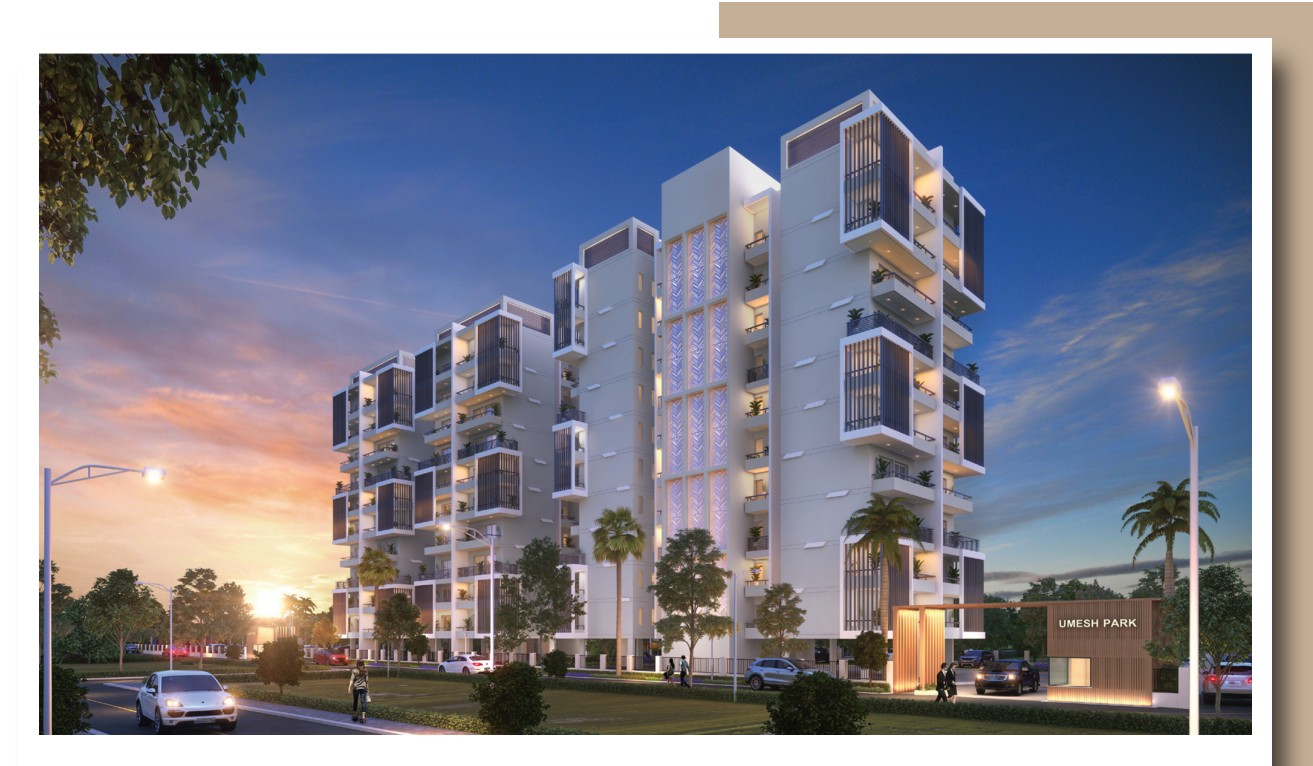
Artistic view of First Residential Project named as "Umesh Park Phase-I"at Modinagar